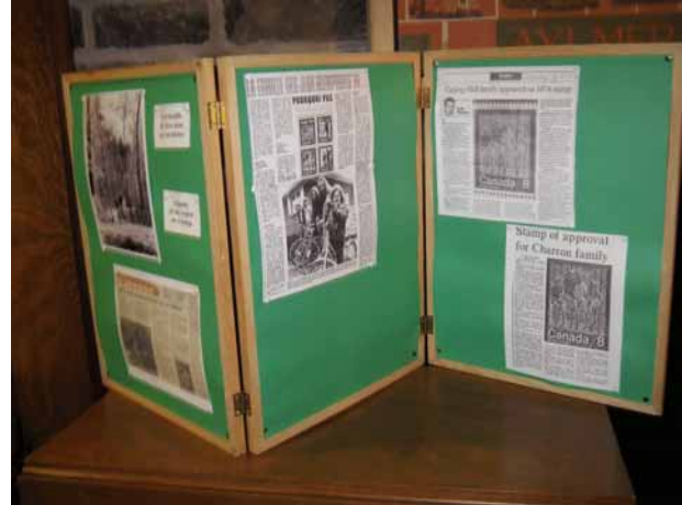
Mini-exhibit on a stamp created and issued by Canada Post about the Charron family, from Hull, in 1974..