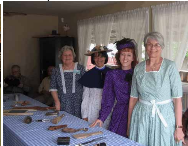
At Accès Volunteer Action Centre