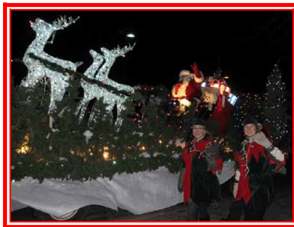
Christmas Parade in front of Symmes Inn Museum, November 26, 2010.