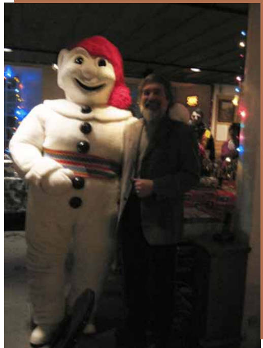
The Bonhomme Carnaval meets our volunteers at the Museum, on November 26, 2010.

And finally, on November 26, we had our Annual Volunteers Supper , for those volunteers who make it possible for the Museum to survive and to be more and more present and active in the community, those volunteers who offer so generously their time, energy, equipment and other supplies. Because of an agreement made with APICA a few years back, the Museum's Volunteers Supper always coincides with the Gatineau's Christmas Parade , which starts right in front of the Symmes Inn; the Symmes Inn is all illuminated for the occasion. The parade, this year, attracted some 40,000 people and our volunteers had the opportunity of meeting with the Bonhomme Carnaval, who came inside the Museum with the Ice Hogs from Winterlude; later on, we could watch Santa Claus, on his float, passing in front of the Museum. A great and enjoyable evening to end up a pretty busy and successful year!