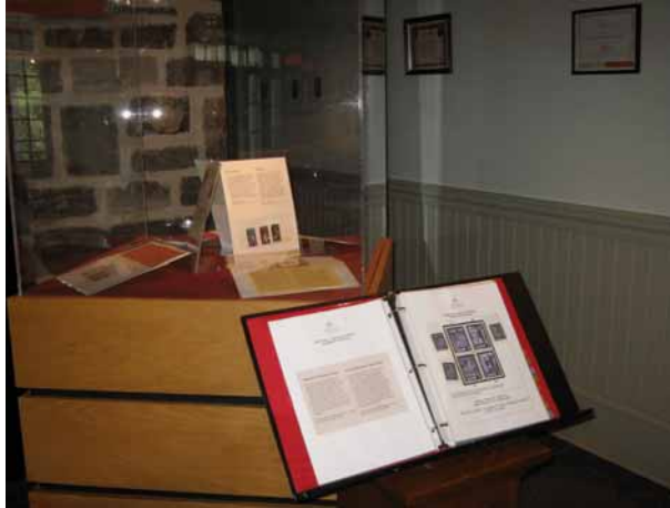
Exhibit of Canadian postage stamps about the Olympics.