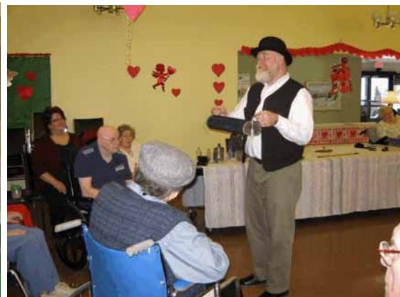
At Centre Renaissance...