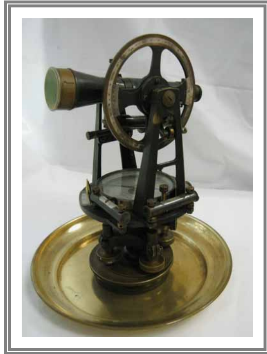
Land survey transit telescope for forest engineers. Given by Claude Turmel.