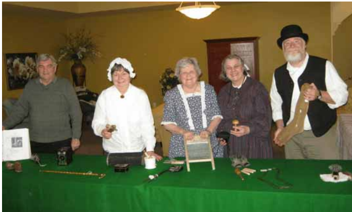
At the Monastery...