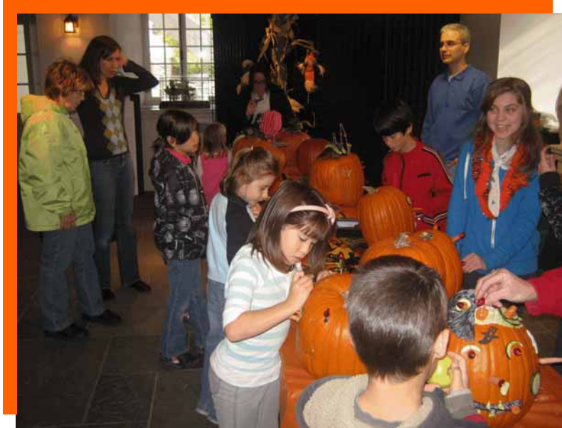
Harvest Festival at the Museum, October 17, 2010.