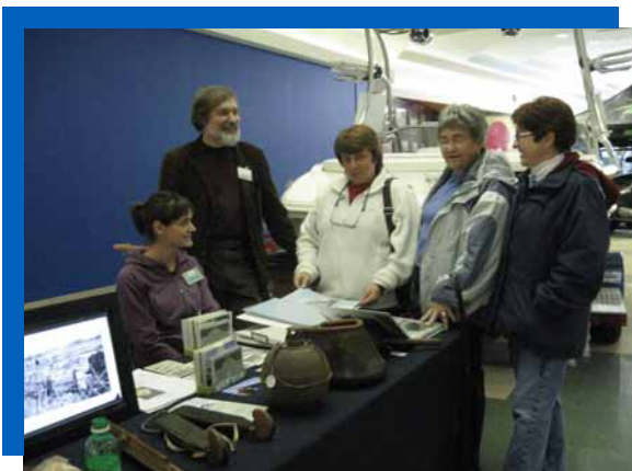
Symmes Inn Museum's kiosk at Galeries Aylmer, for the annual exhibit of Outaouais heritage/historical organizations, February 20, 2010.